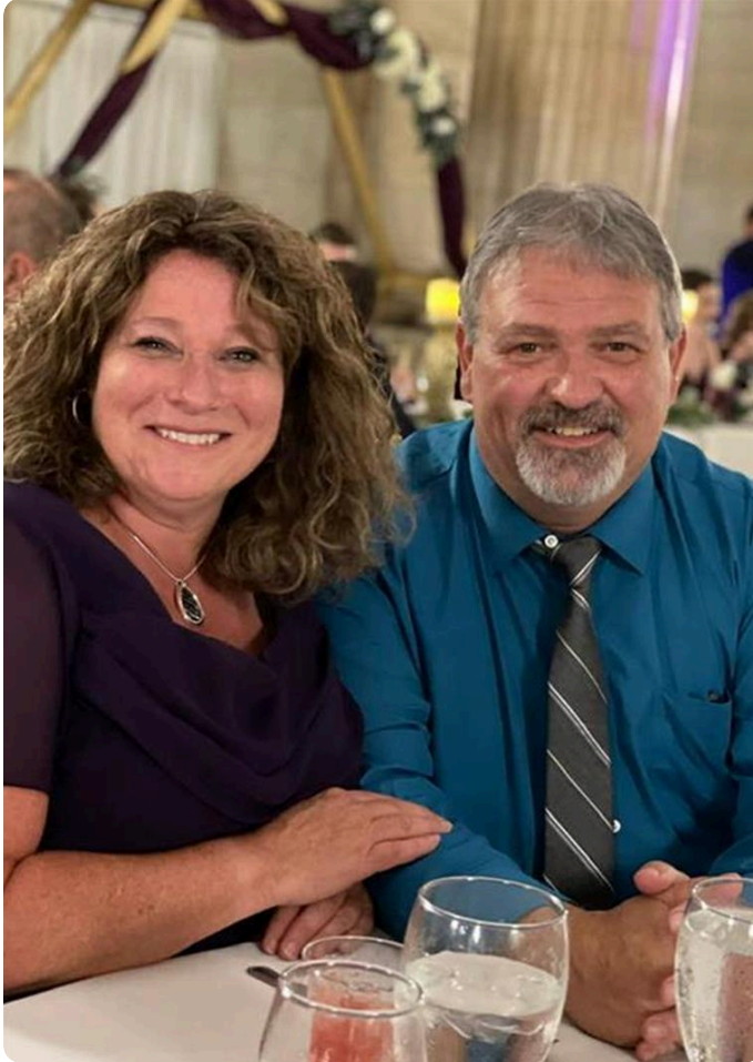
Love spoken here